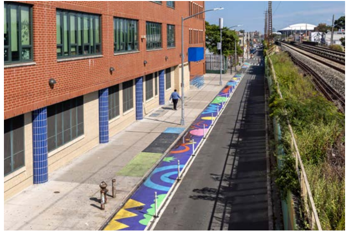
Emily Eldridge Playscape , 2025 44th Avenue between Junction Boulevard and National Street, Queens