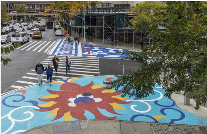
Chenlin Cai The Beauty of Four Life Essentials , 2024 St. James Place and Pearl Street, Manhattan