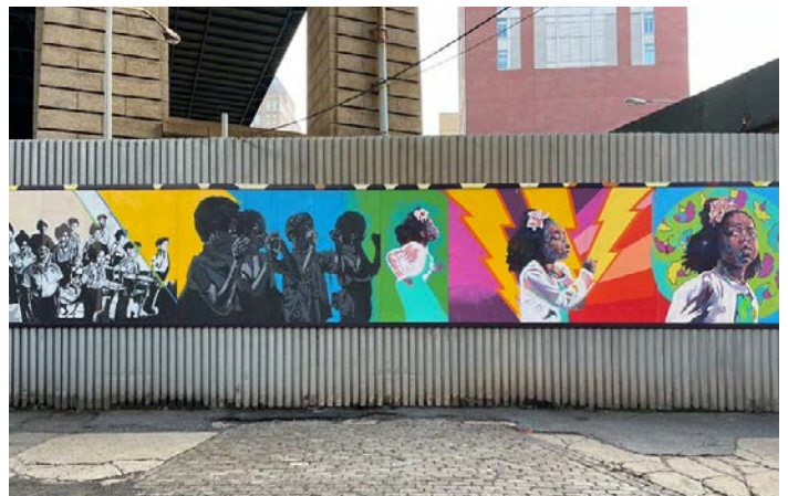
Sophia Dawson Standing in the Gap , 2022 Front Street between Adams Street and Pearl Street, Brooklyn